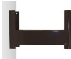
Horizontal Mounting Bracket for Post or Tree