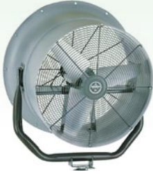
HV Basic JetAire Fan (Mounting sold separately)