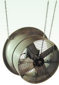
HV JetAire Chain suspended