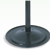
45" Pedestal Mount & Base