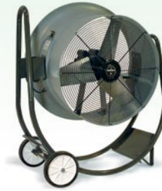
HVD JetAire Dolly mount